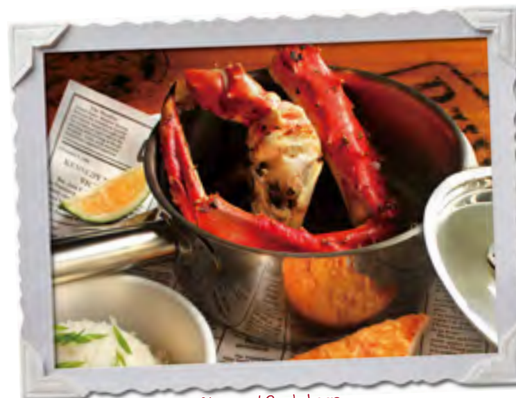
Steamed Crab Legs

Steamed Crab Legs 1,900 Steamed Crab Legs in Garlic and Herbs and served with Garlic Bread and Jasmine Rice.