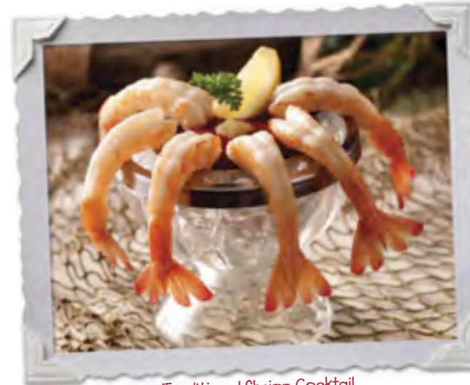
Traditional Shrimp Cocktail

Lightly breaded, crispy Chicken Wings coated with our very own Kentucky Bourbon Sauce. Choice of Regular or Spicy. Served with Carrot and Celery Sticks and Blue Cheese Dressing.