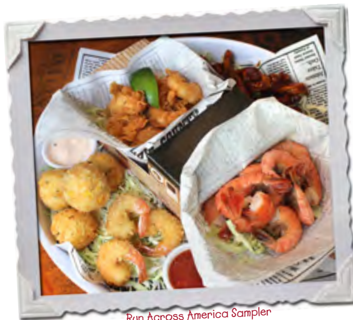
Run Across America Sampler

Frizzled Onion Strings 195 Hand breaded Frizzled Onions, fried to golden brown, served with BBQ, Ranch and Chili Ancho Dippin' Sauces.