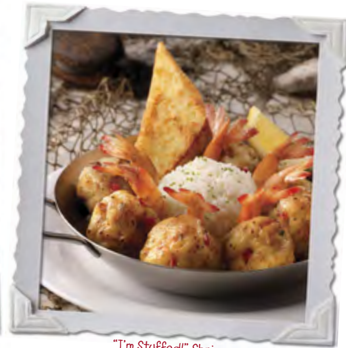
"I'm Stuffed!" Shrimp