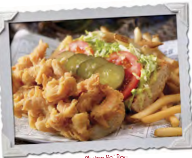
Shrimp Po' Boy

Shrimp Po' Boy 395 Of course we have a Po' Boy, and of course it's made with Shrimp, and we couldn't be prouder!