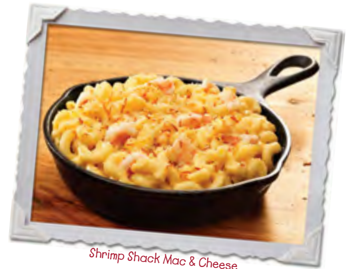
Shrimp Shack Mac & Cheese