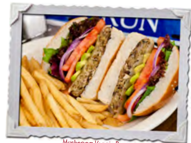
Mushroom Veggie Burger