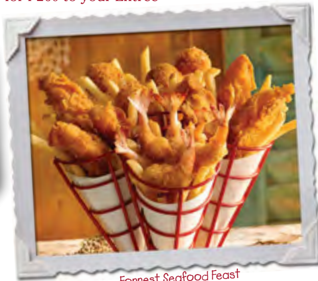
Forrest Seafood Feast

Forrest's favorite meal after a day on the boat! Hand Breaded Southern Fried Shrimp, Seafood Hush Pups, Fish & Chips, Coleslaw... And don't forget the delicious Sauces for dipping - Tartar, Cocktail and Remoulade.