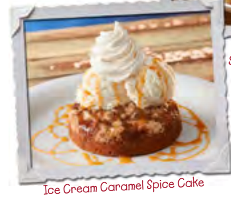
Ice Cream Caramel Spice Cake