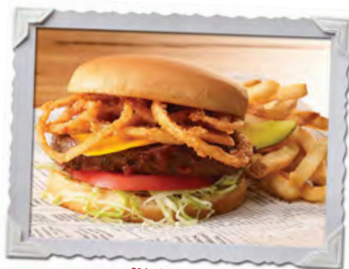
BBQ Cheese Burger

BBQ Cheeseburger 425 Our classic burger with sweet and tangy BBQ Sauce, Cheddar Cheese, and Frizzled Onions.