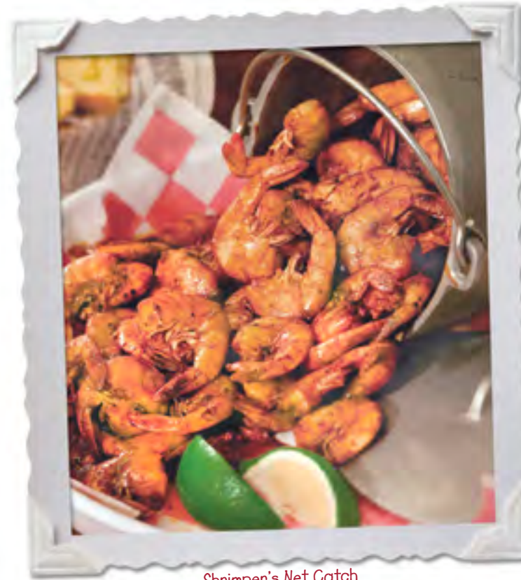
Shrimper's Net Catch