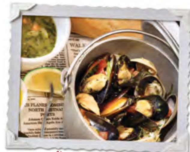
Steamed Clams & Mussels

Captain's Fish & Chips 530 Beer battered Dory. Junior Portion 415