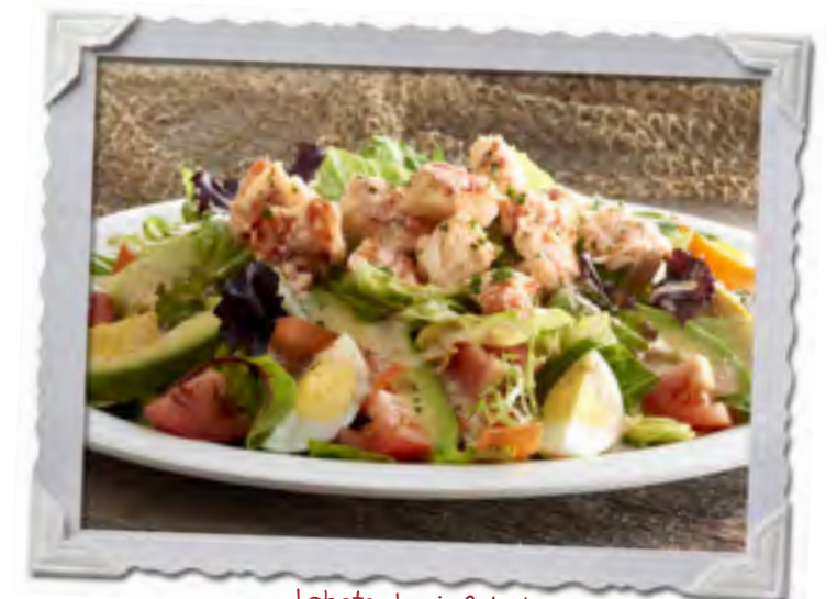
Lobster Louie Salad

Chilled Lobster Meat served over Romaine mix, hard boiled Eggs, Avocado, and sliced Tomatoes. Topped off with our very own creamy Seafood Salad Dressing.