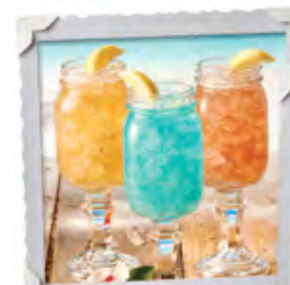
Tennessee Iced Tea / Georgia Peach Iced Tea / Electric Iced Tea

Coronarita 390 Relax - we'll bring the beach to you! Our traditional margarita with a squeeze of Lime is then topped with Corona Extra. A special treat! Try our Watermelon Coronarita 390