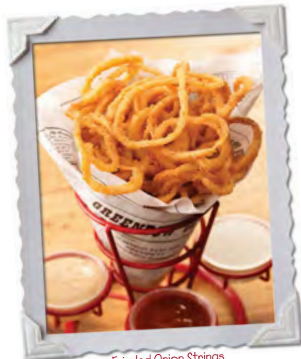
Frizzled Onion Strings

Run Across America Sampler 695 Popcorn Shrimp, Chilly Shrimp, Spicy Chicken Strips, Hush Pups, and Mama Blue's Fried Shrimp.