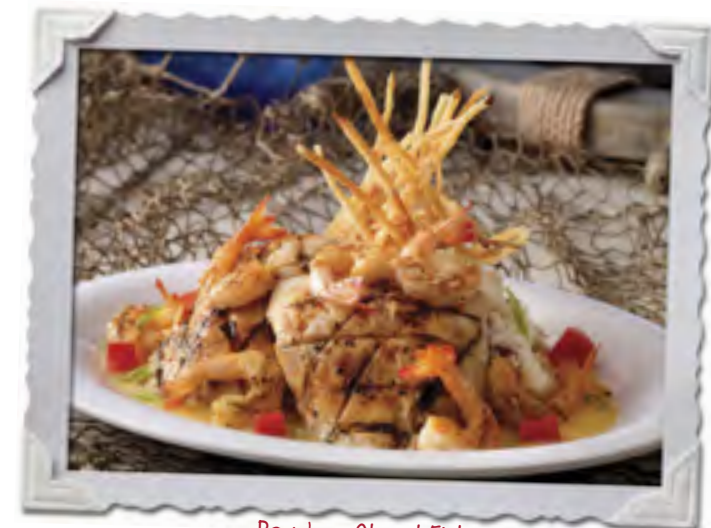
Bourbon Street Fish

Bubba's Grilled Salmon in Creamed Spinach 680 Salmon Fillet grilled to perfection, served over Garlic Mashed Potatoes and Herbed White sauce with Spinach.