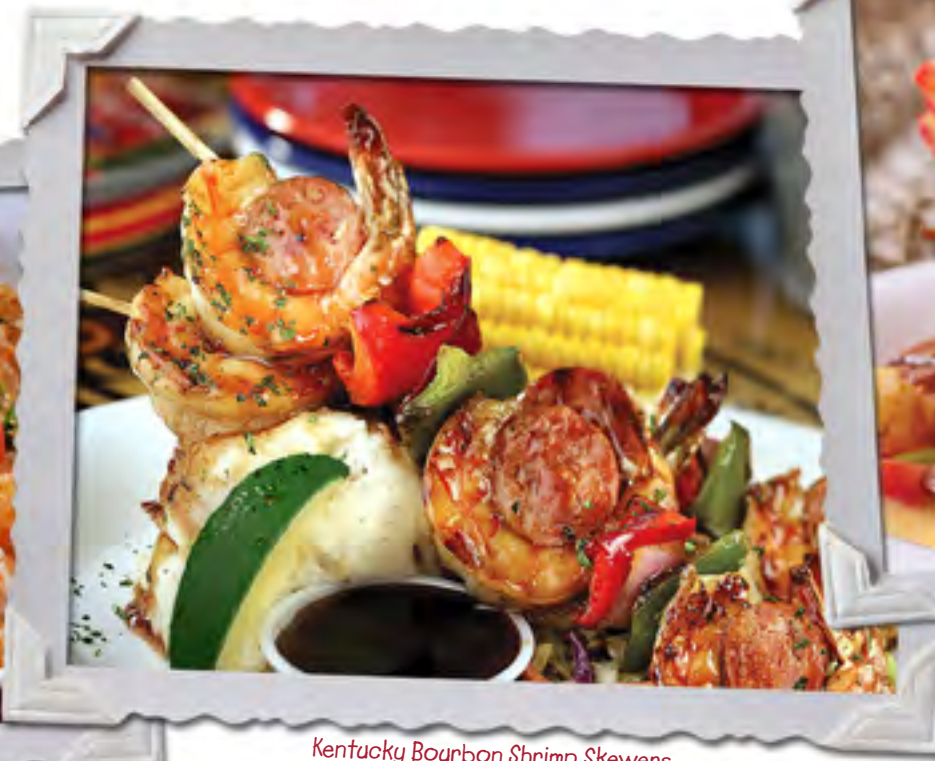
Kentucky Bourbon Shrimp Skewers

Tender Shrimp and Spicy Andouille Sausages with Red and Green Bell Peppers and Red Onions served with Mashed Potatoes, Corn, Coleslaw, and with our very own Kentucky Bourbon Sauce.