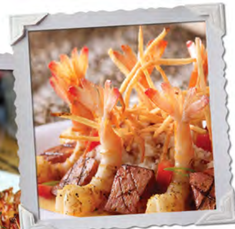
Lt. Dan's Drunken Shrimp

Tender Shrimp in spicy Bourbon Sauce with Andouille Sausage and Garlic Mashed Potatoes.