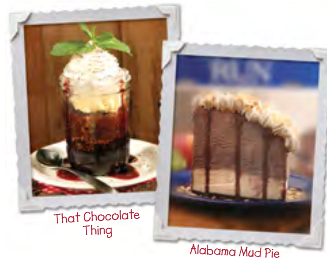
That Chocolate Thing

Cool layers of Chocolate and Vanilla Ice Cream with chunks of SNICKERS® topped with Caramel and streams of Chocolate Syrup, smothered with crunchy Peanuts.