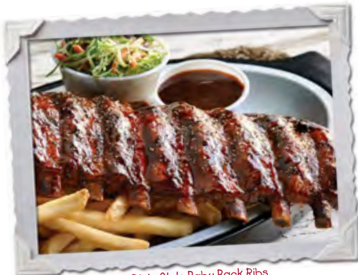
Dixie Style Baby Back Ribs

10 oz. USDA with Mashed Potatoes, Frizzled Onion Strings and Coleslaw.