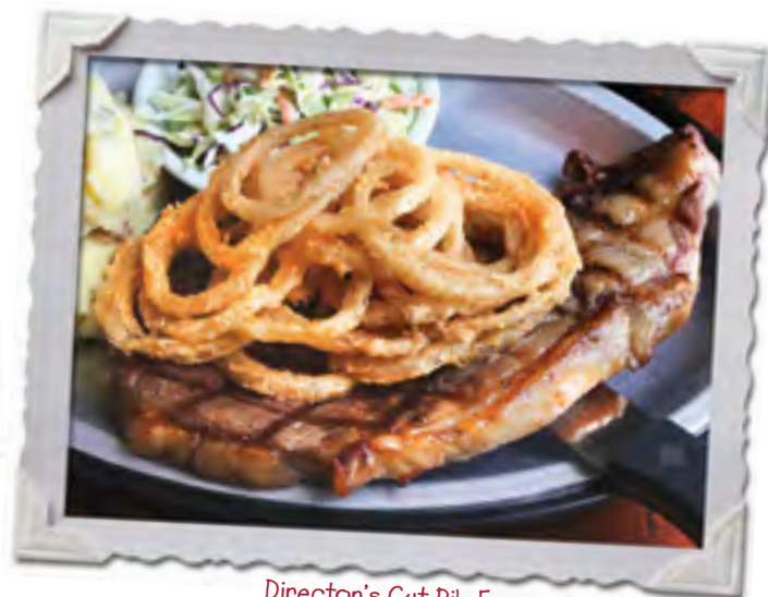
Director's Cut Rib Eye