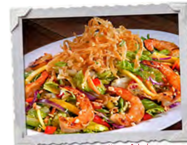
Yin Yang Shrimp Salad

Tossed Greens with Croutons and your choice of Dressing: Thousand Island, Vinaigrette, Ranch or Honey Mustard.