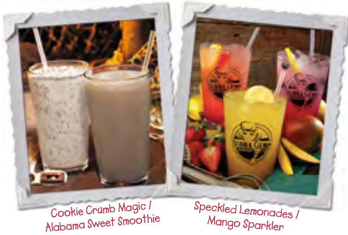
Cookie Crumb Magic / Alabama Sweet Smoothie

Run Forrest Run Smoothie 190 Fresh Oranges, Strawberries, Bananas and Soft Serve Raspberry Ice Cream.