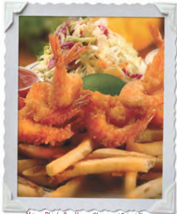
Mama Blue's Southern Charmed Fried Shrimp

This one's for you! Hand Breaded Coconut Shrimp, Grilled Shrimp, Fried Shrimp, and Japanese style Tempura Shrimp with Fries. And of course great Dippin' Sauces like Tangy Asian, Cajun Marmalade, and Zesty Cocktail.