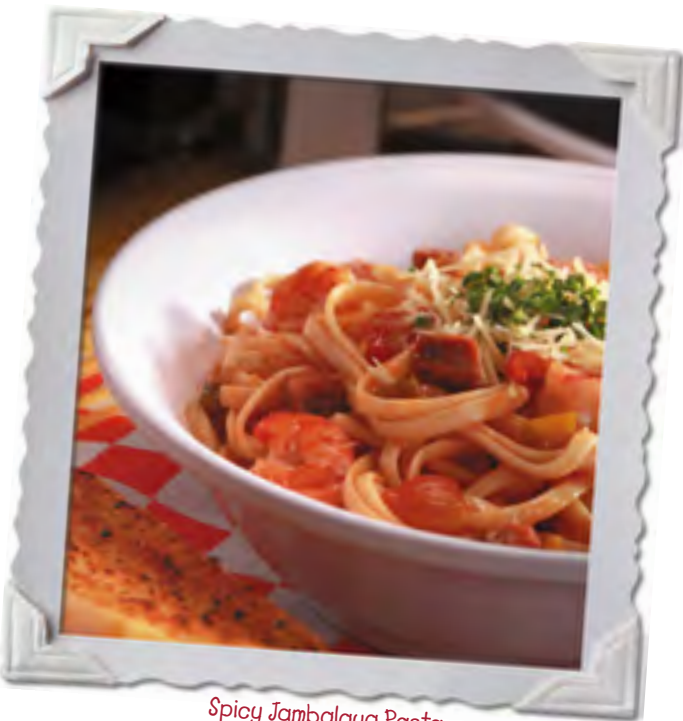
Spicy Jambalaya Pasta

Shrimp and Spicy Andouille Sausage over Linguini with our very own Jambalaya Sauce.