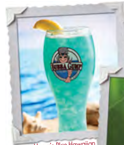
Mama's Blue Hawaiian

Tropical Breeze 260 Mango, Melon Liqueur, Orange Juice and other refreshing Tropical Juices.