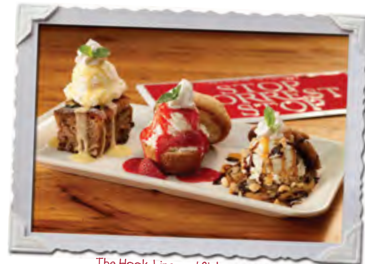
The Hook, Line and Sinker

Mama's warm Bread Pudding, homemade Biscuit topped with Strawberries and melt in your mouth Chocolate Chip Cookie Sundae.